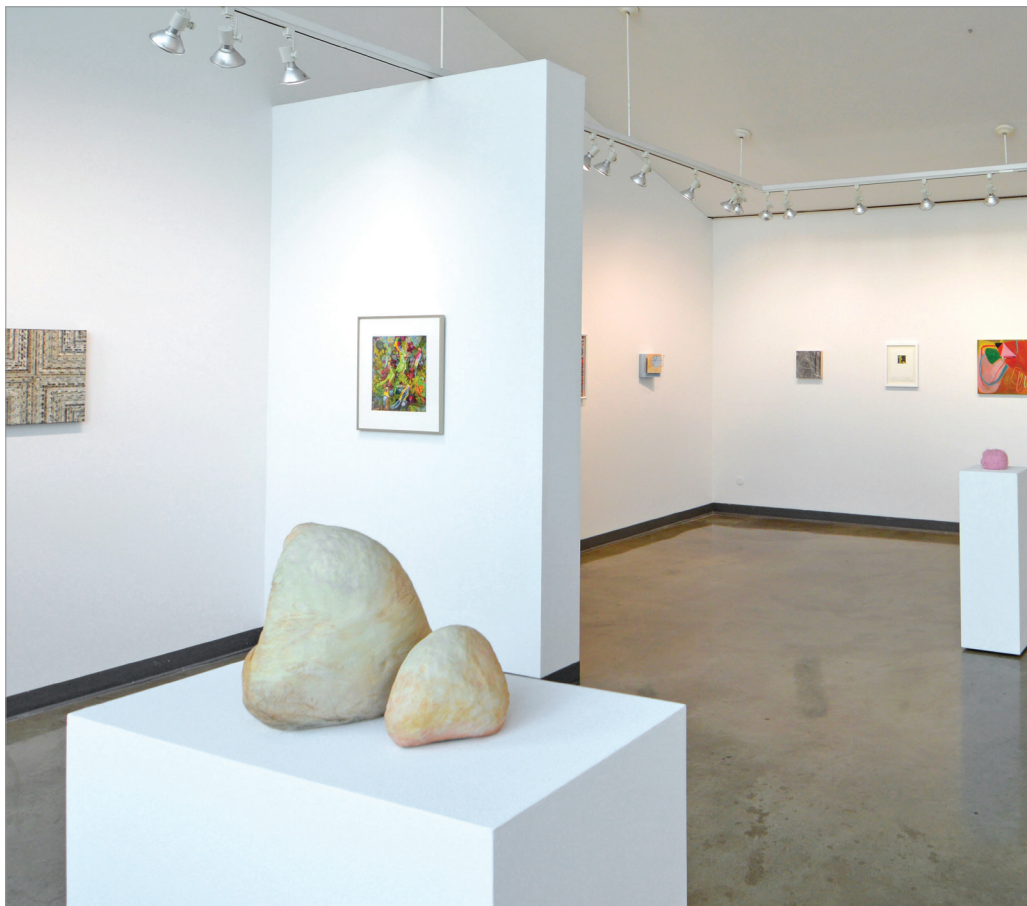
2018 Small Works exhibition, installation view

Our gallery hosts visiting artists' exhibits, student works and juried exhibitions throughout the year. Except as noted, all events are held in the Exhibition Space (Building C, Room C200) and are free and open to the community, Monday through Thursday, 9 a.m.–4 p. m.